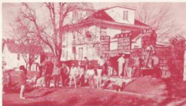
Who's got the pumps? Homecoming takes a group effort and last fall there was no problem drawing a crowd.