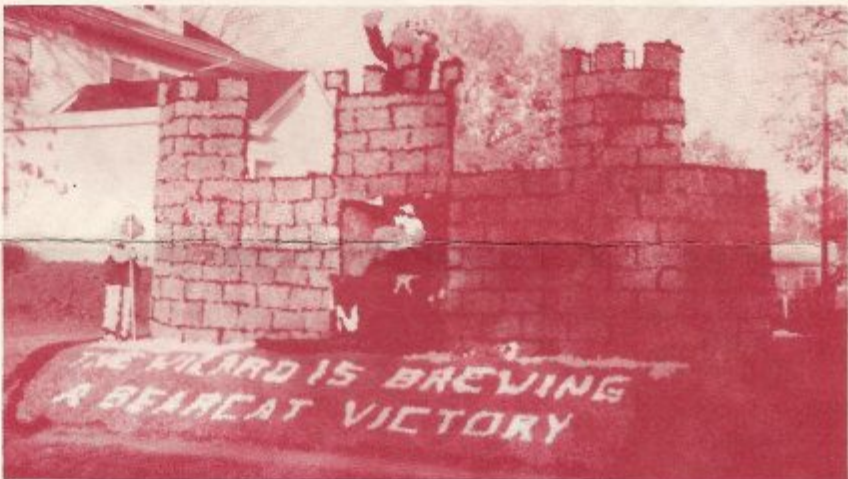
The Wizard of Id was a temporary resident in the back yard at Homecoming.