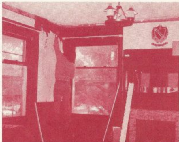
The fireplace room was the recipient of new wallpaper and new furniture.