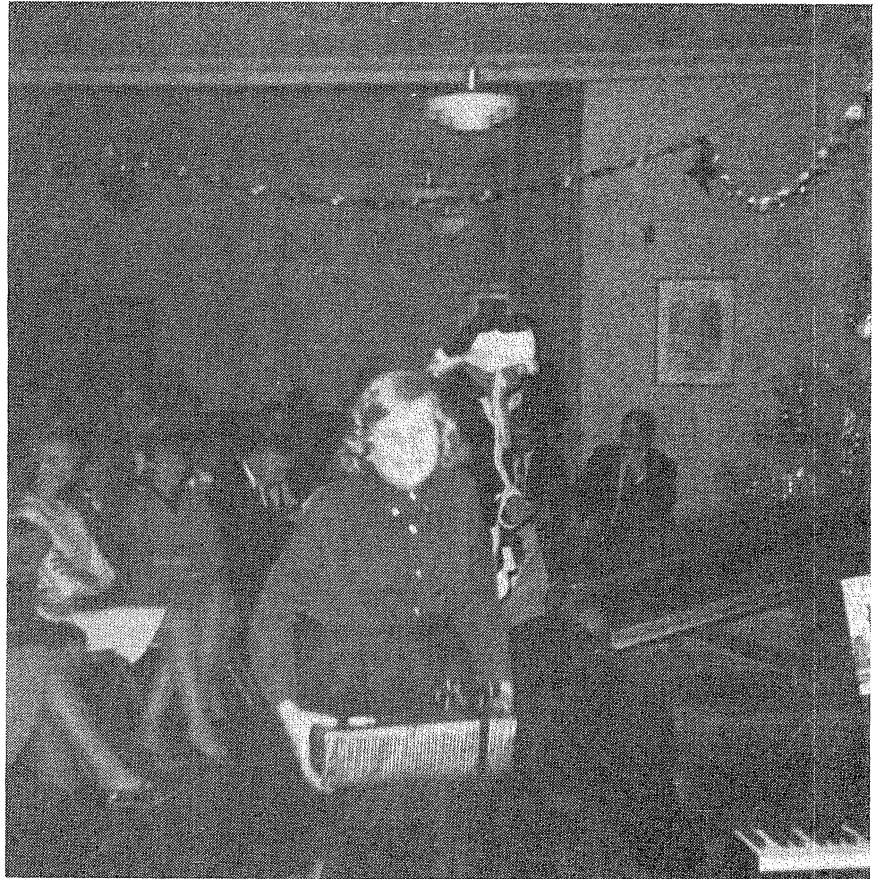
Annual Orphan's Party

But the chapter has decided to return some value on contributions after all. Alumni dues, as you know, are payable in May, just before Uncle Sam's budget bashing. This year these dues will include all of your meals at the house while you are back for the Spring Formal and all of the incidentals at a cocktail party immediately preceding. Your ten dollar alum dues will help lay the new foundation.