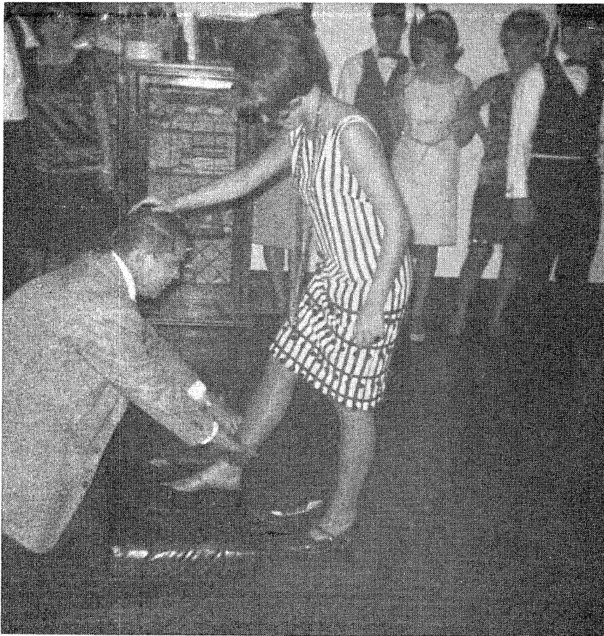
Annual Garden Party