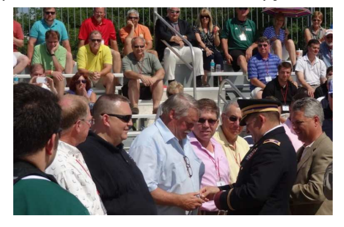
celebration. Approximately 170 Tekes attended events on Friday and/or Saturday. The weather was absolutely perfect for both days.

The weekend was one to remember for Delta-Nu. Thank you to all of those who were able to attend any part of the