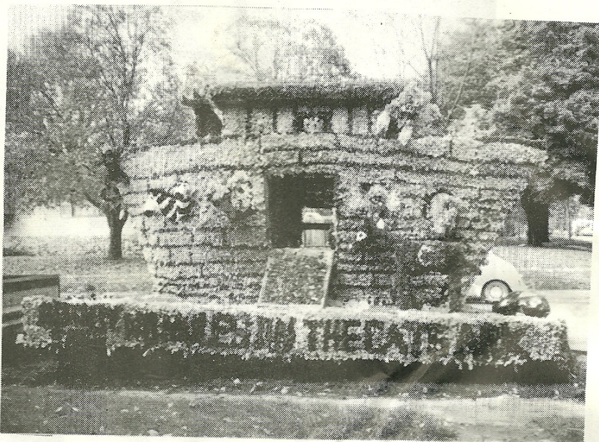
"NO MULES ON THE CAT'S ARK" - First Place Float