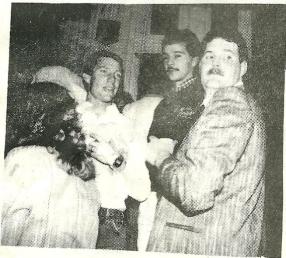
Where did she go guys?